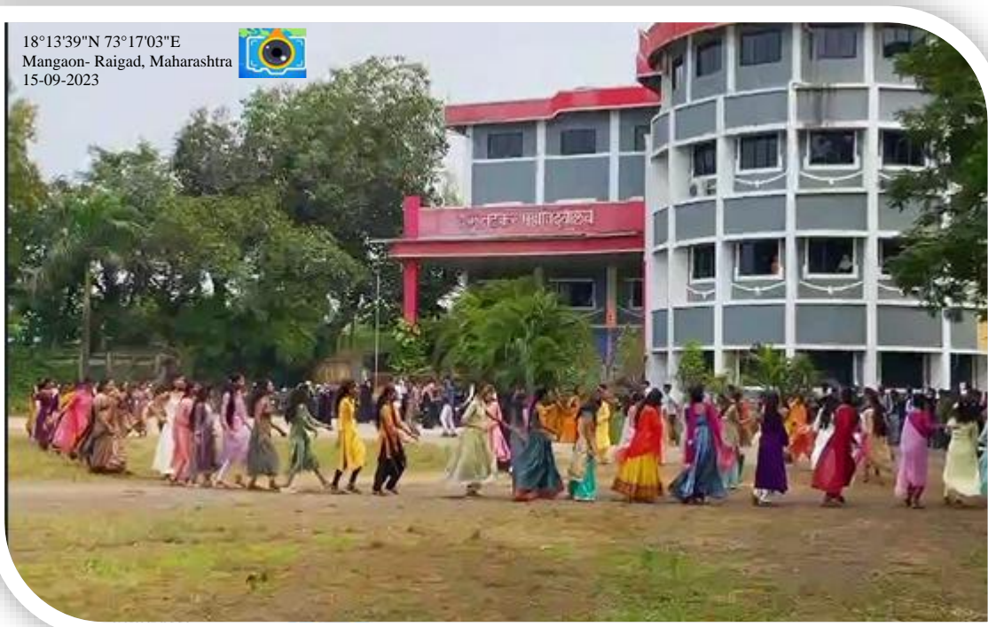
Garba dance in Navaratri