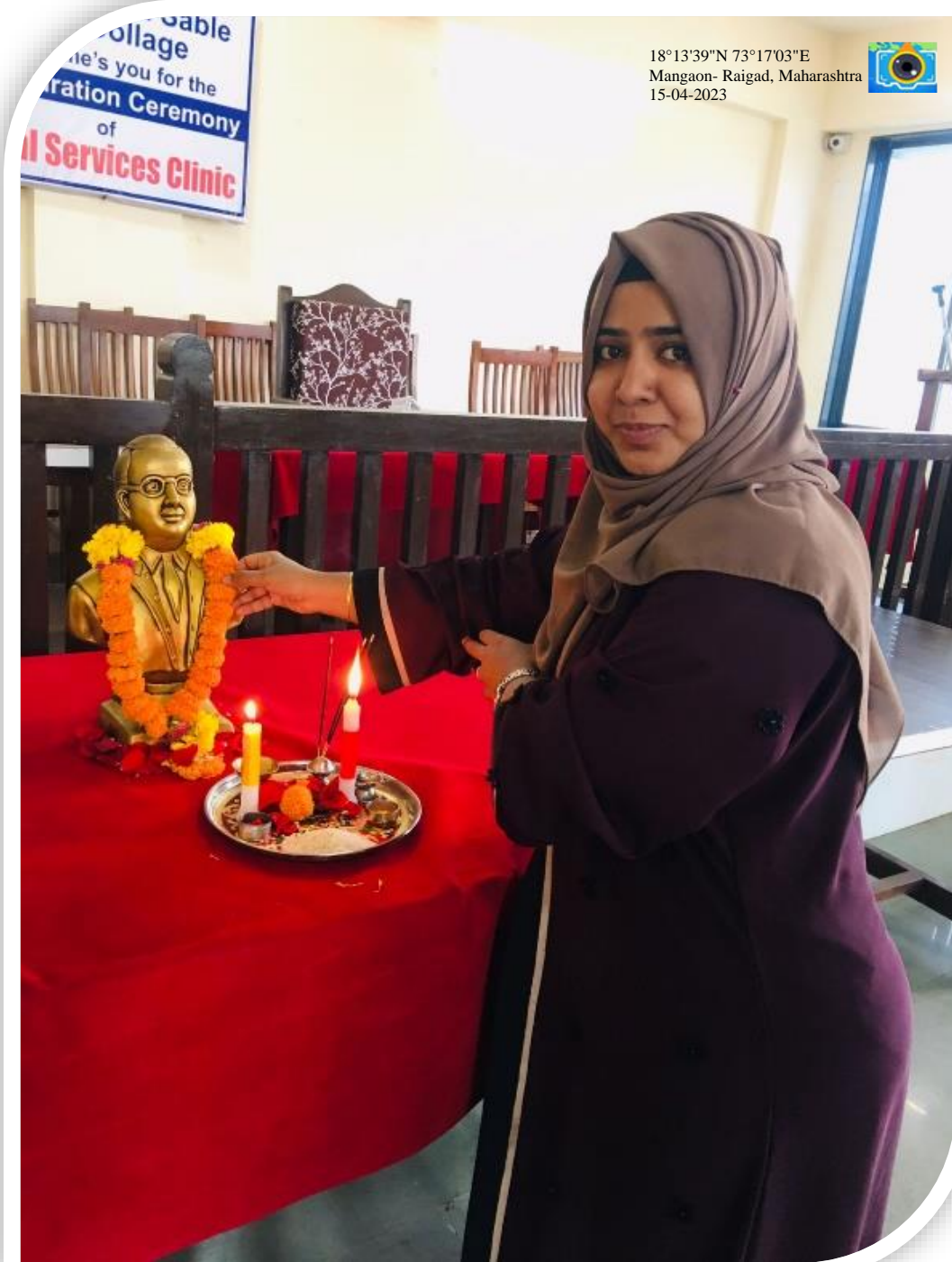
Dr. Babasaheb Ambedkar Jayanti