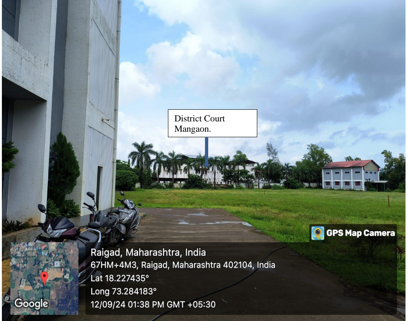
Mangaon Court picture taken from college ground