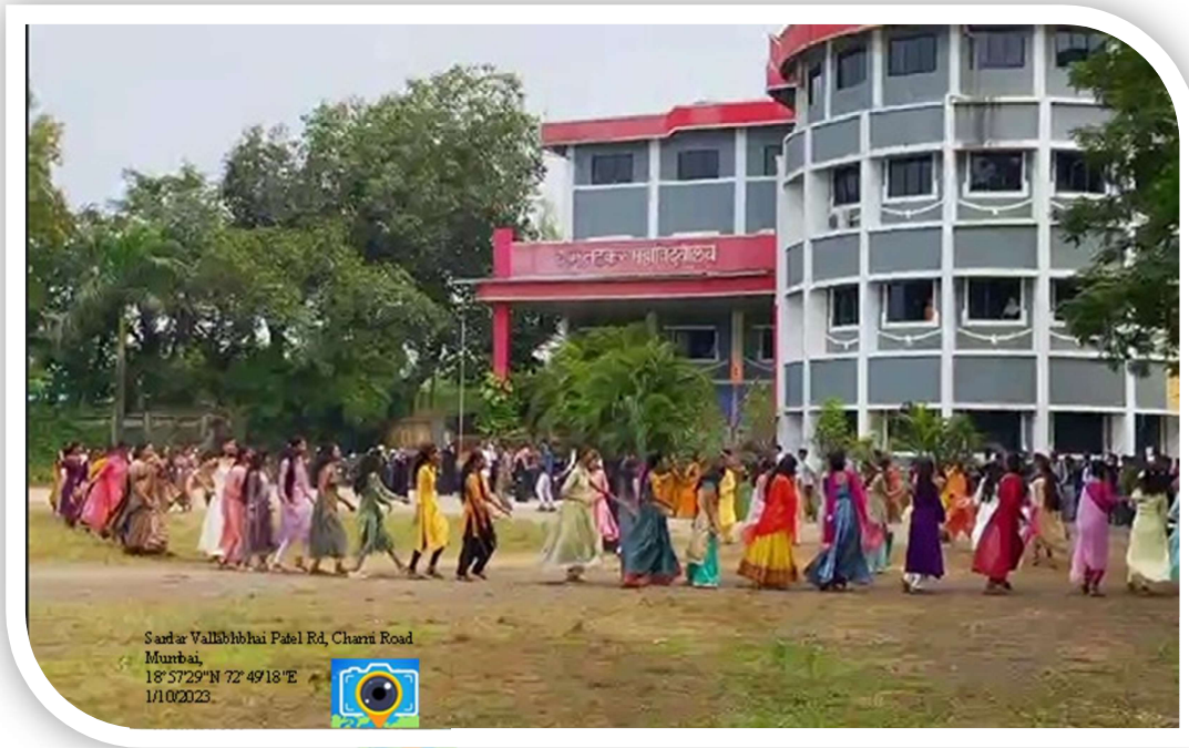
Garba dance in Navaratri