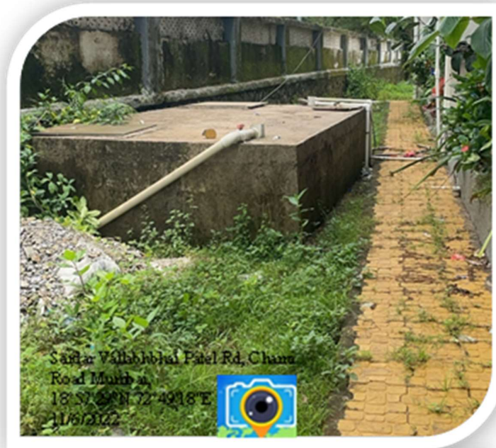
Underground water tanks