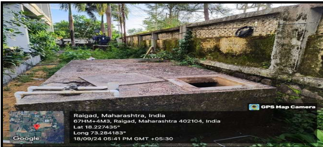
Underground water tanks

Raigad, Maharashtra, India 67HM+4M3, Raigad, Maharashtra 402104, India Lat 18.227435° Long 73.284183° 18/09/24 05:41 PM GMT +05:30