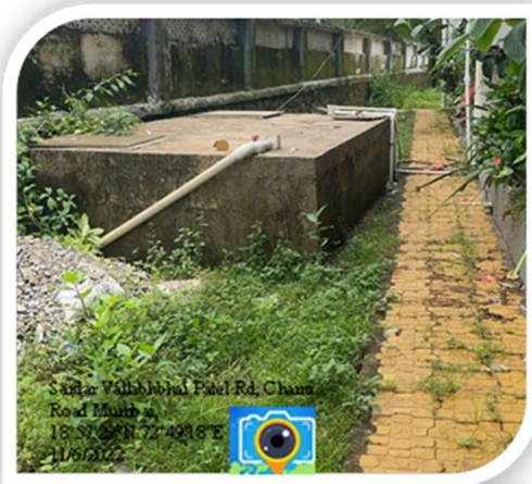
Sardar Vallabhbhai Patel Rd, Charni Road Mumbai, 18° 57' 29" N 72° 49' 18" E 11/16/2022

ASLC has a proper water harvesting system through which water is collected in water tank. The stored water is then used for the washroom and gardening purpose.