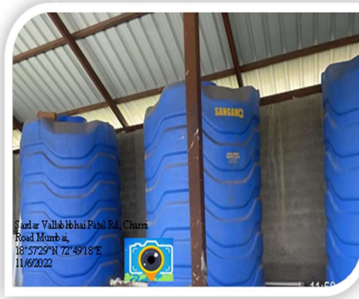
Sardar Vallabhbhai Patel Rd, Charni Road Mumbai, 18° 57' 29" N 72° 49' 18" E 11/16/2022